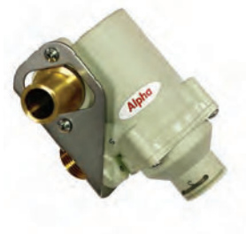
Cyclone Filter Part Number: 3.034133 BS7593: 2019 compliant