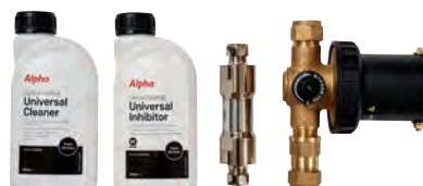
Protection Pack Part Number: 6.5500055 BS7593: 2019 compliant