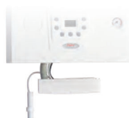
Condensate Pump Part Number: 3.026374