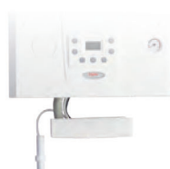
Condensate Pump Part Number: 3.026374