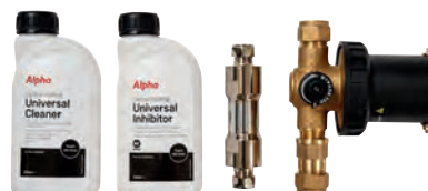
Protection Pack Part Number: 6.5500055 BS7593: 2019 compliant