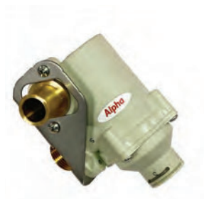
Cyclone Filter Part Number: 3.034133 BS7593:2019 compliant